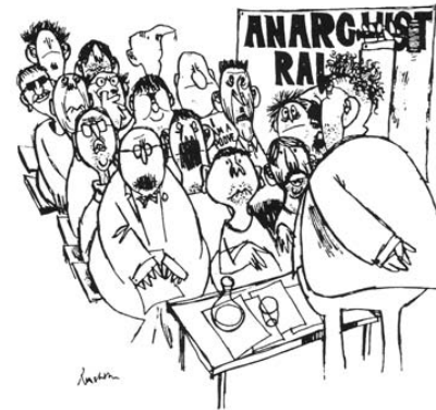
"Gentlemen, gentlemen! Disorder, please, disorder!"

While such action precludes formal organisation, it most certainly does not eschew effective co-ordination, achieved through the informal networks